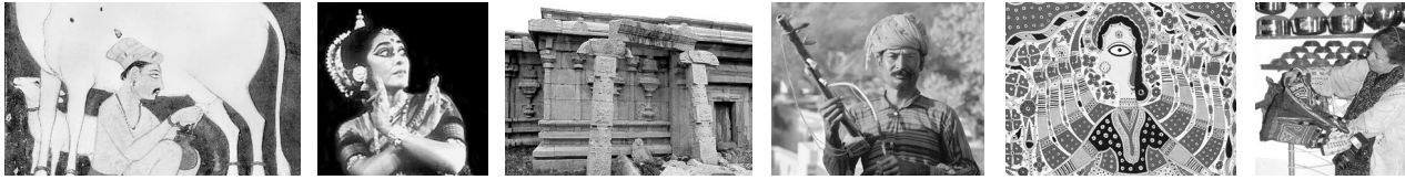
A SAMPLING OF DIVERSE OUTSTANDING EVENTS FROM SACHI AND ITS BAY AREA PARTNERS

SACHI (Society for Art and Cultural Heritage of India) is a nonprofit, educational organization that was formed to serve as a forum for promoting, understanding, and appreciating the richness and diversity of the art, culture, and heritage of India.